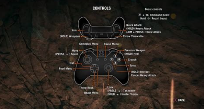
Control ps4 characters. Control ps5 trophy list.